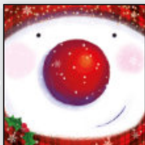
Red Nosed Snowman SOLD OUT