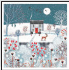
Winter Cottage SOLD OUT