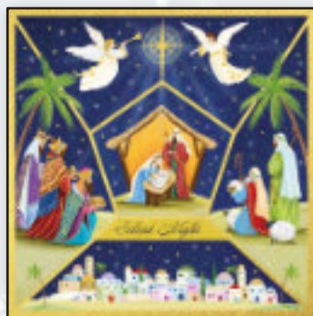
Silent Night 150 × 150 mm (gold foil) £3.95 for 10 cards