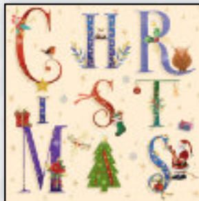
Christmas SOLD OUT