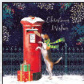
Christmas Post SOLD OUT