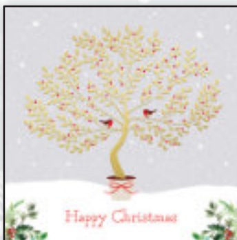
Golden Tree SOLD OUT