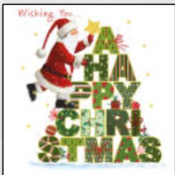
Placing the Star SOLD OUT