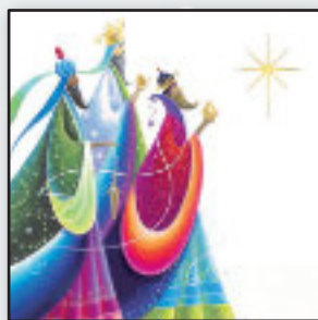
Bearing Gifts 126 × 126 mm £3.75 for 10 cards