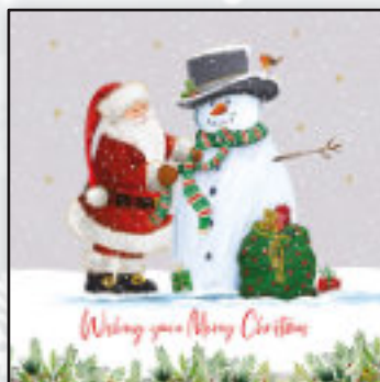
Winter Friends SOLD OUT