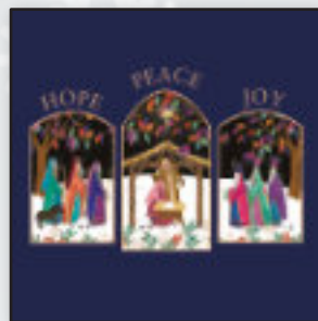
Christmas Tidings 126 × 126 mm £3.75 for 10 cards