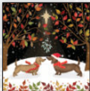
Christmas Kiss SOLD OUT