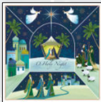
Holy Night 150 × 150 mm (copper foil) £3.95 for 10 cards