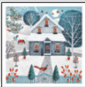
Welcome Home SOLD OUT