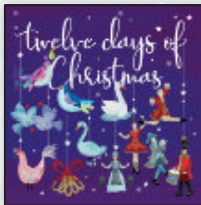
12 Days of Christmas SOLD OUT