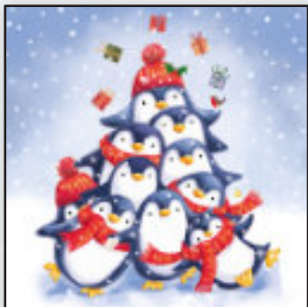
Penguin Christmas Party SOLD OUT