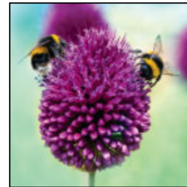
Bees on Allium Notecard 121 × 121 mm (blank inside, limited stock)

SALE £1.50 for 10 cards (free with orders of 3 or more Christmas card designs, while stocks last)