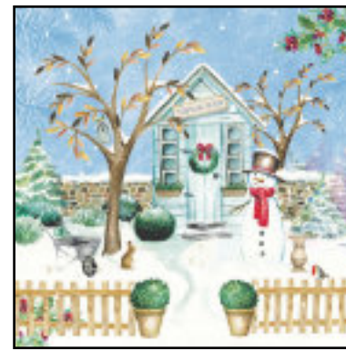
Winter Gardening 126 × 126 mm £3.50 for 10 cards