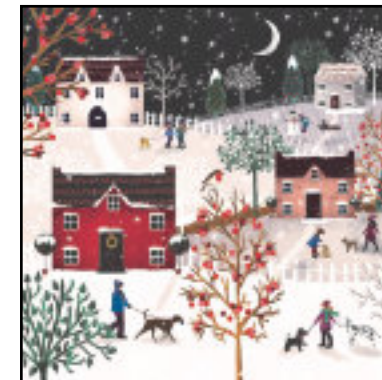
Christmas in the Country 126 × 126 mm £3.50 for 10 cards

A virtual High Street of retailers online – convenient, hassle-free Christmas shopping, at no additional cost – awaits at easyfundraising.org.uk . Hundreds of stores, special offers and incentives, and each shop willing to donate to ME Research UK. Sign up, nominate ME Research UK as your chosen charity, and shop away!