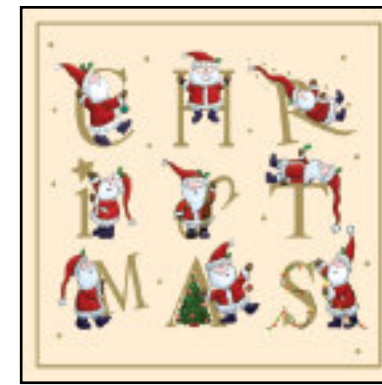
Merry Christmas, Santa 150 × 150 mm (gold foil) £3.75 for 10 cards