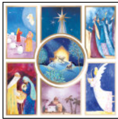
Christmas Story 121 × 121 mm (gold foil, limited stock) £3.75 for 10 cards