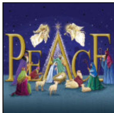
Peace 150 × 150 mm (gold foil) £3.25 for 10 cards

Register to support ME Research UK on Amazon Smile, and Amazon will donate a percentage of the value of your purchases to us. It is that simple and convenient. Same range, same price, and support ME Research UK as you shop.