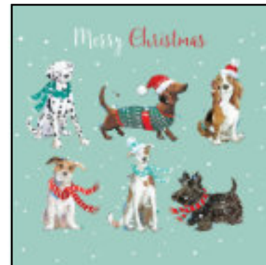
Canine Christmas 121 × 121 mm £3.50 for 10 cards