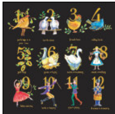
12 Days of Christmas 126 × 126 mm £3.50 for 10 cards

On the back of each card, there is a little note about our charity, so your friends and family can learn a bit about us which also helps raise our profile.