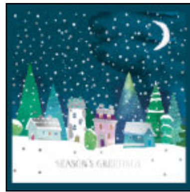
Winter's Night 121 × 121 mm (silver foil) £3.50 for 10 cards