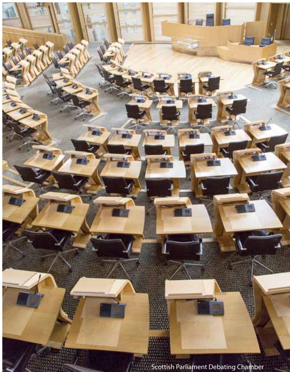
Scottish Parliament Debating Chamber